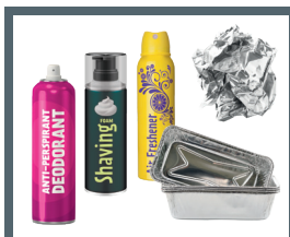
Aerosols and foils