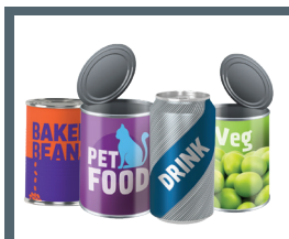
Food and drink cans