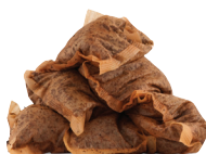
Tea bags and coffee grounds