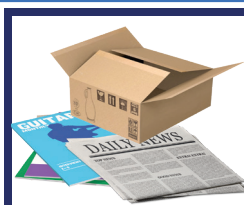
Paper and card

The content of the box can be sent directly to a paper mill in Kent where it will be recycled