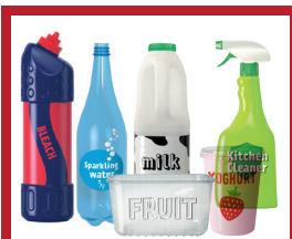
Plastic bottles, films and containers