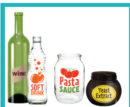
Glass bottles and jars

You can recycle these in your pink sacks