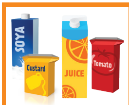
Food and drink cartons